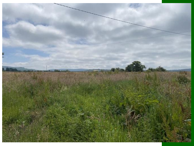
Price on Application